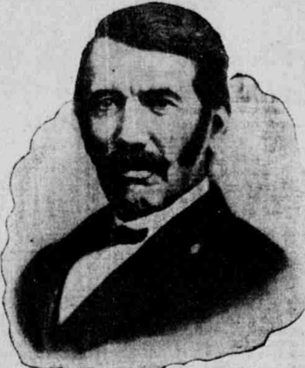
DAVID LIVINGSTONE The White-Man-Who-Would-Go-On