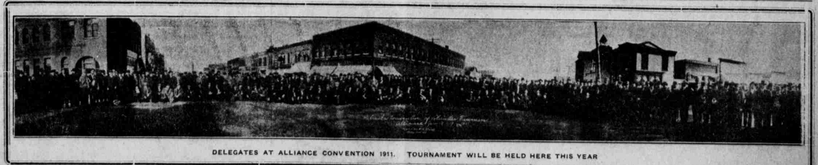
DELEGATES AT ALLIANCE CONVENTION 1911. TOURNAMENT WILL BE HELD HERE THIS YEAR