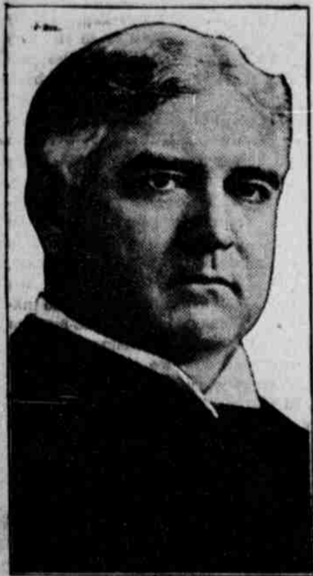
ASHTON C. SHALLENBERGER Democratic Candidate for United States Senator.

A real progressive in politics is one who, by his past conduct has proven that he is in sympathy with, and a supporter of, the men who aim to make this government better. An advocate of those principles of government which aim to make laws responsive to the will of the people. Measured by this standard, Governor Shallenberger is a genuine progressive. Progressiveness with him is a matter of conviction; a part of his life work; a record of the things he has done. His claim to that title is not based on mere promises or sudden changes in his political views. He was fighting for progressive principles long before his opponent knew what the word "progressive" meant. His progressiveness is not based alone