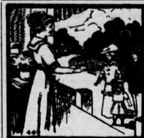
Nohe's Bakery & Cafe