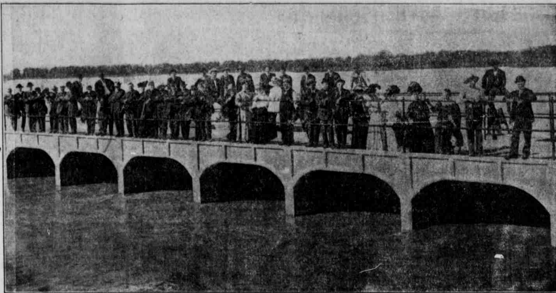
HEADGATES OF ONE OF THE BIG VALLEY CANALS Plenty of Water for Irrigation. The Immense Pathfinder Reservoir in Wyoming Stores One Million Acre Feet

of the Valley is a rich, sandy loam, adapted to growing of all heavy crops. Constant tilling in some parts of the Valley for twenty-five years has not impoverished its fertility, and this soil is some of the richest to be found. Artificial fertilizers are not necessary, although the growth of some crops can be increased by their use. The soil is particularly adapted to irrigation, and on account of its nature, is very easily farmed. Silt carried by the water over the land is worth many dollars per acre per year, as it contains so much in fertilization qualities.