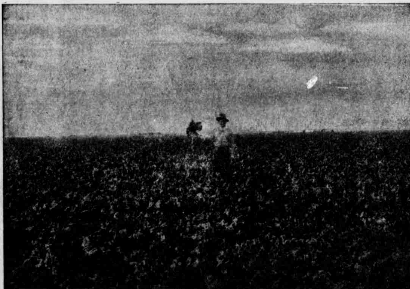
SUGAR BEETS BEING HARVESTED Yield 15 to 20 Tons per Acre. Sell for $5.25 per Ton