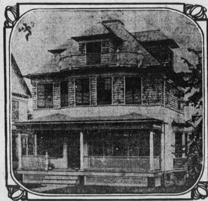
PERSPECTIVE VIEW-FROM A PHOTOGRAPH.