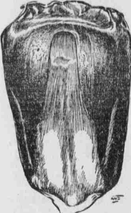
FIG. XI-GOOD TYPE OF HERNEL. thing that must be done for every locality, since corn shipped in from any distance cannot be relied on. It is entirely possible to increase the yielding ability of a strain of corn ten bushels to the acre or more by a very few years' breeding. Seed from such an improved strain will find a ready market at satisfactory figures.

One of the most profitable special lines that can be followed is breeding mproved seed corn. This is some-