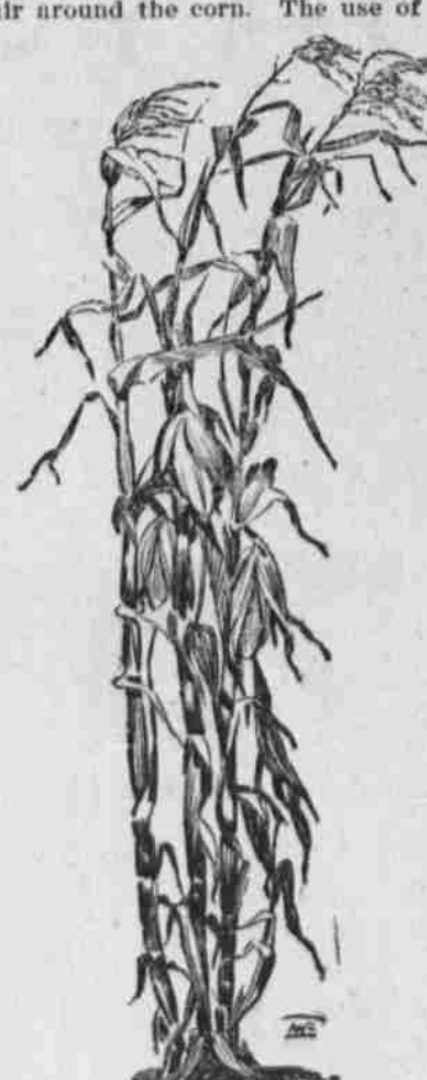
FIG. XII-GOOD HILL OF CORN. strings, one at each end of the ear keeps it from warping, as it will warp if tied by one string in the middle,

Where several hundred bush corn are to be saved for seed, as is year. It should be straight, symmetrical and not taper too abruptly. The the case where a specialty is being phone 251. Office over Alliance Shoe Store rical and not taper too abruptly. The the case where a specialty is being Phone 251. Residence Phone 251. made of well bred seed corn, it is necessary to have some sort of special seed corn house. This may be filled with slatted racks, on which the corn ed breed of corn has its peculiarities of is laid, or the ears may be hung from the ceiling with binder twine. The mits a more thorough circulation of air around the corn. The use of two