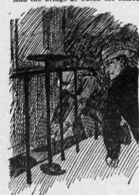
"Now!" he cries hoarsely.

disaster is planned to take place lies just eight miles beyond.