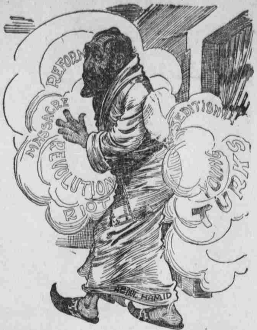
"BY THE BEARD OF THE PROPHET, IT'S TOO HOT FOR ME!" —Baltimore Sun.