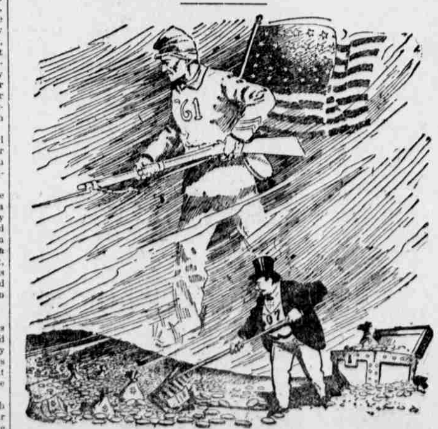
Some of the patriotism of '61 should enter into present day activities.